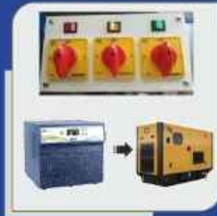
24/7 power back up DG with option to use AC