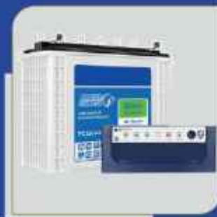
Plug & Play Inverter provisions