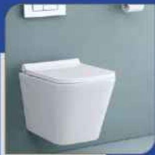
Wall mounted closets