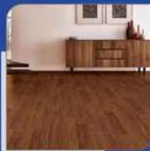
Wooden flooring in Master bedroom