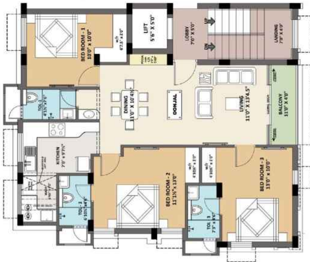
1A - 1539 sft (3 BHUPK-3T)