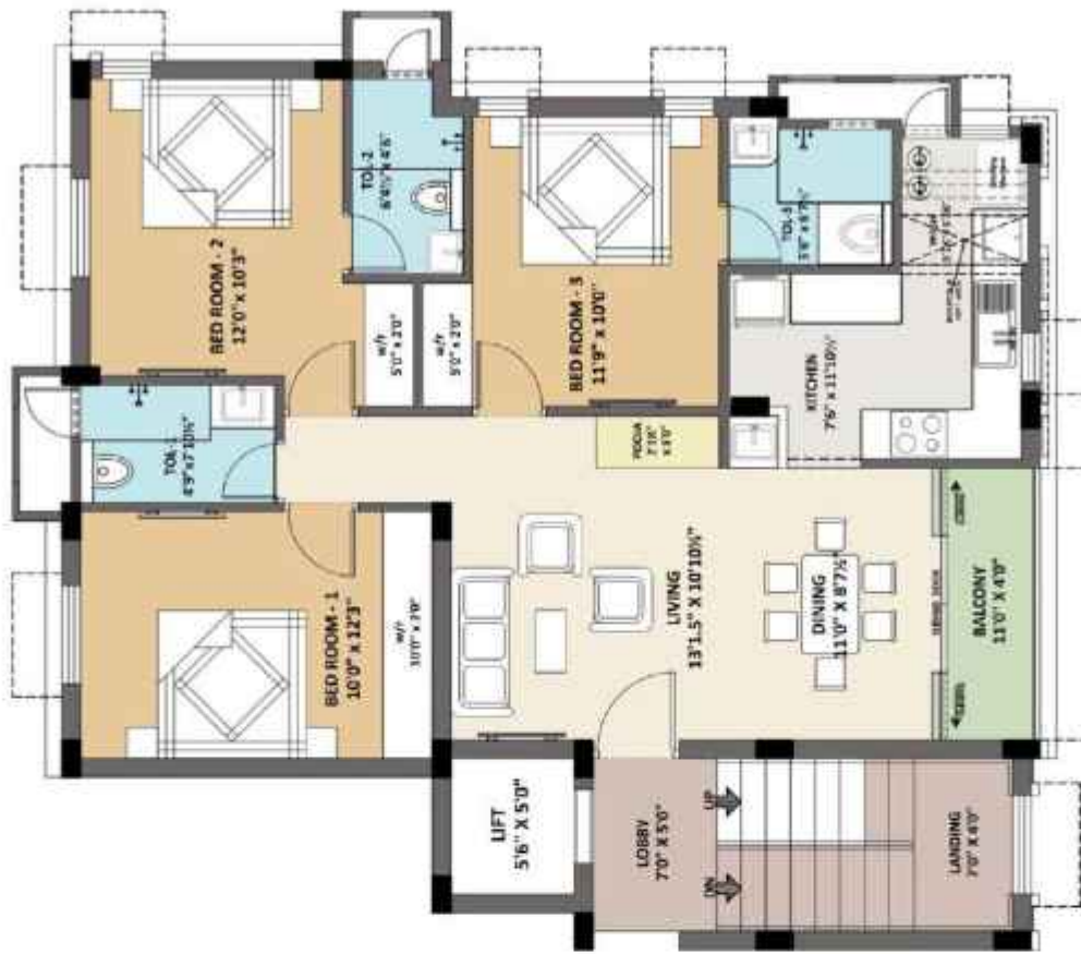
1B - 1525 sft (3 BHUPK-3T)