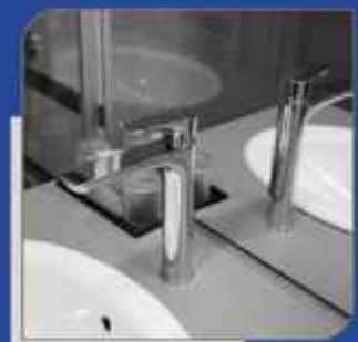
Premium branded Sanitary fittings