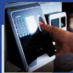
Bio metric access