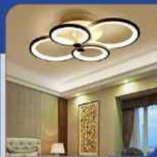
Ceiling light points for modern LED fittings