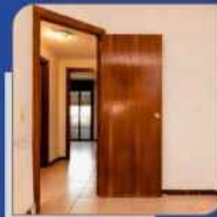
8 Ft factory finished doors