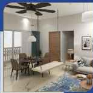
Pre fixed Unjal provisions