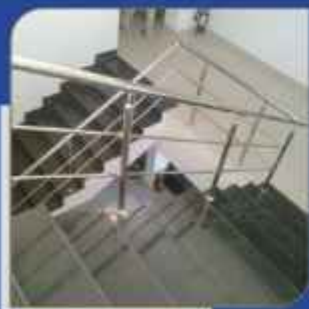
SS Handrails in duplex