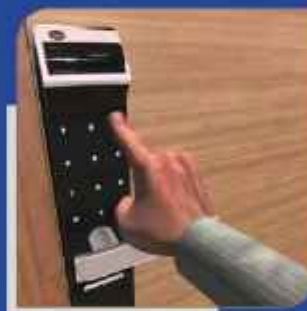
3 in 1 Digital locks for main doors