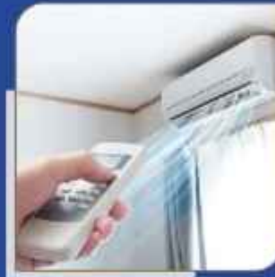
Customised Plug & Play AC Provisions