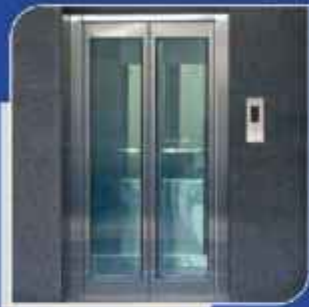
Glass view SS clad lifts with cladded walls