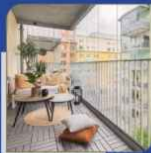
11 ft Large Glass Balconies