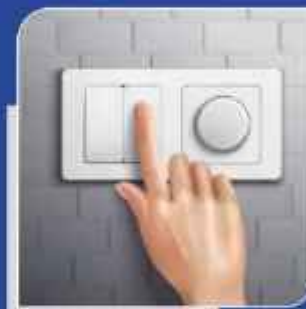
Premium branded Modular switches