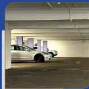
2 reserved car parks per apartment