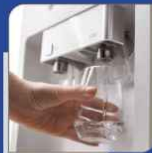
Bore well & Metro water facility