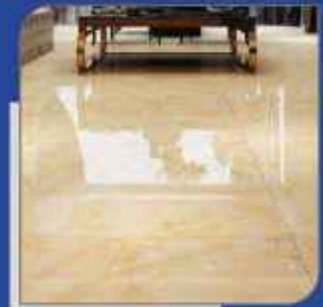
Large designer floor tiles