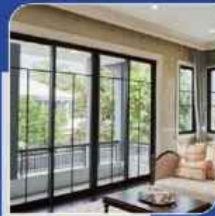
Black Aluminium joineries