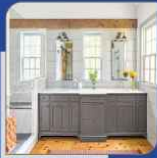
All side ventilation

Guarantees "HOME" is unique as compared to mere houses